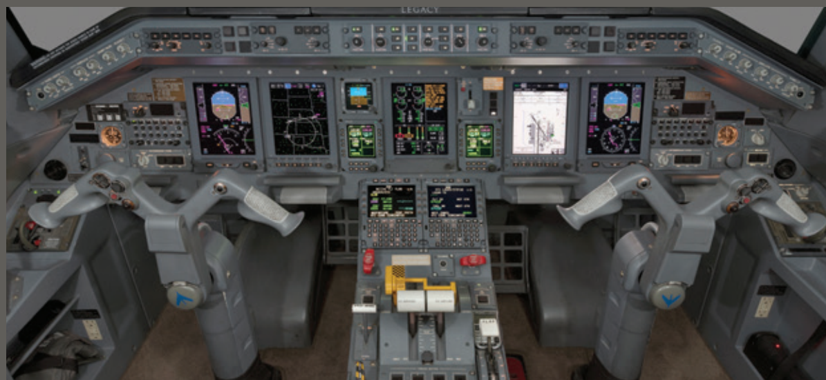
Honeywell Primus Elite (DU-875 displays) in an Embraer Legacy

Over the last 25 years, Duncan Aviation has invested more than $53 million in technical and soft skills training for its team members.