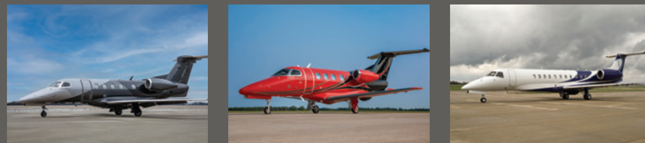
Embraer 500 Paint Timelapse: www.DuncanAviation.aero/videos/embraer-500-paint

"Duncan Aviation performed a LU144 (12-year) inspection along with a complete, customized paint job from August to November 2020. There were so many obstacles that year due to the pandemic on top of the huge maintenance event we had scheduled. The quality and attention to detail we received during our time at Duncan Aviation is why we come back every year. The finished project from both paint and maintenance exceeded our expectations. The process that led up to that great outcome was also very impressive. Our input was well-received from start-to-finish, which produced a synergistic environment."