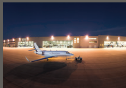
Battle Creek, Michigan